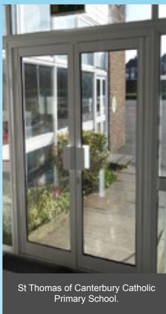
St Thomas of Canterbury Catholic Primary School.

www.wallerservices.com sales@wallerservices.com